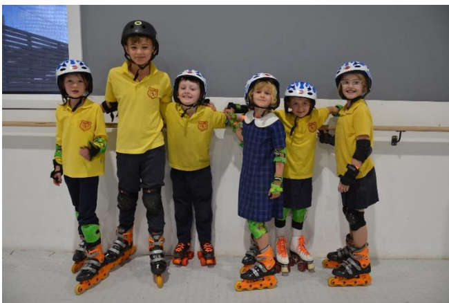
A few spills but lots of fun!